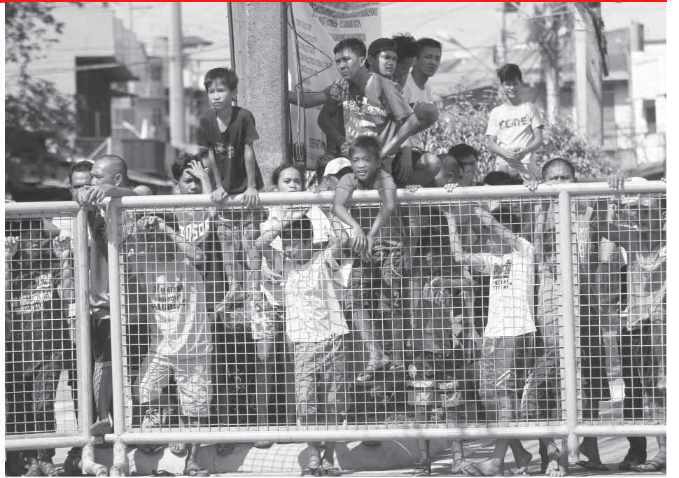
Residents of nearby barangay watch behind metal barriers while concrete houses and shanties are being demolished in Brgy. 26-C Salmonan, Quezon Boulevard on Monday.

Philippine News Agency is a web-based newswire service of the Philippine government under the supervision of the News and Information Bureau (NIB) of the Presidential Communications Office (PCO).