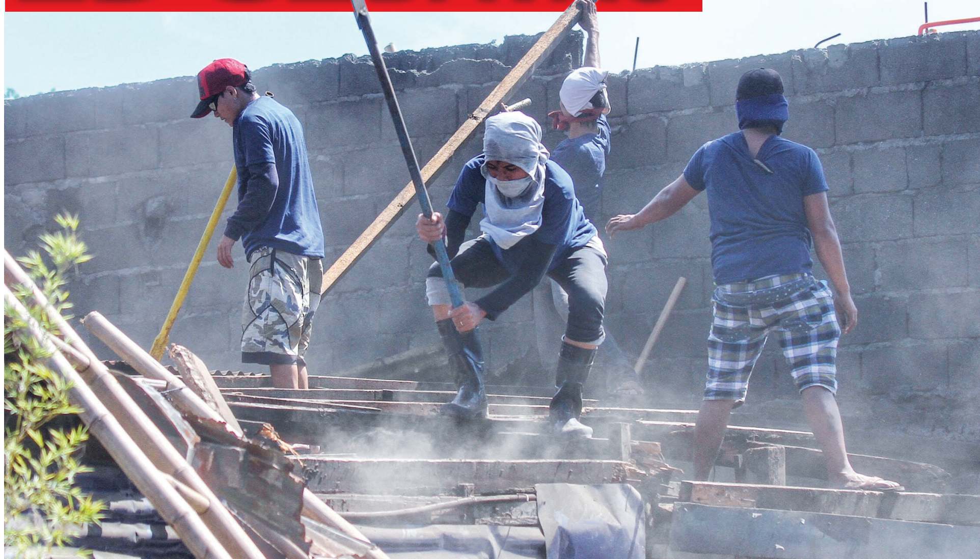
Members of the demolition team tear down illegally built concrete houses and shanties during a demolition in Brgy. 26-C Salmonan, Quezon Boulevard on Monday.