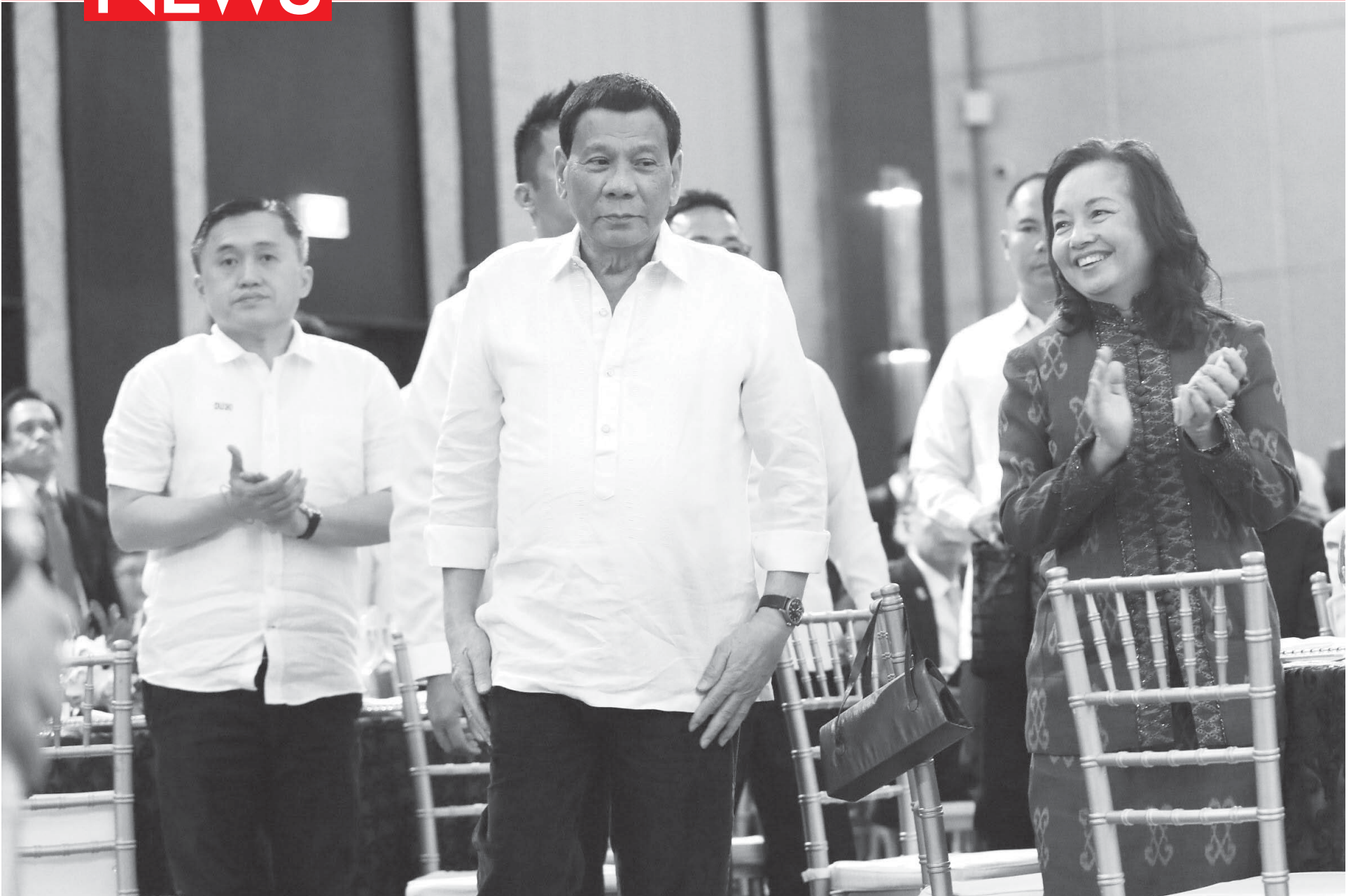
President Rodrigo Duterte gets a warm round of applause as he is welcomed during the 51st Asian Development Bank (ADB) Annual Meeting at the EDSA Shangri-La Hotel in Ortigas Center, Mandaluyong City on Friday evening. Also in the photo are Sec. Bong Go of the Office of the Special Assistant to the President and former President and incumbent Pampanga Second District Representative Gloria Arroyo.