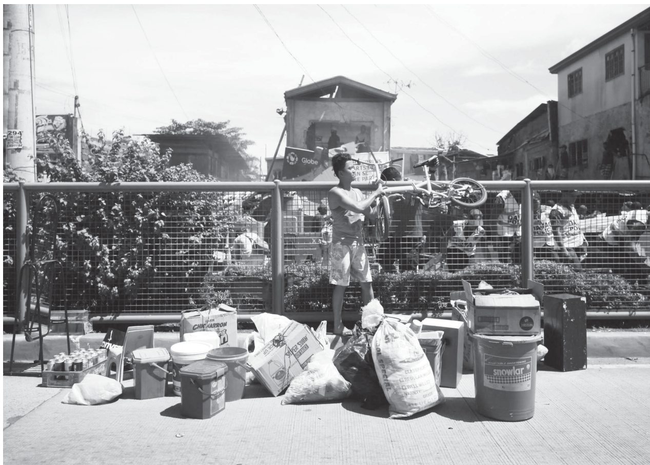
Evicted residents collect and gather their belongings while there is an ongoing demolition of illegally built houses and shanties in Brgy. 26-C Salmonan, Quezon Boulevard on Monday.

In line with this training, the Filipino official said they have set-up mock-up facilities to be able to design the training activities in scenarios that will highlight military operations in urban terrain. (PNA)