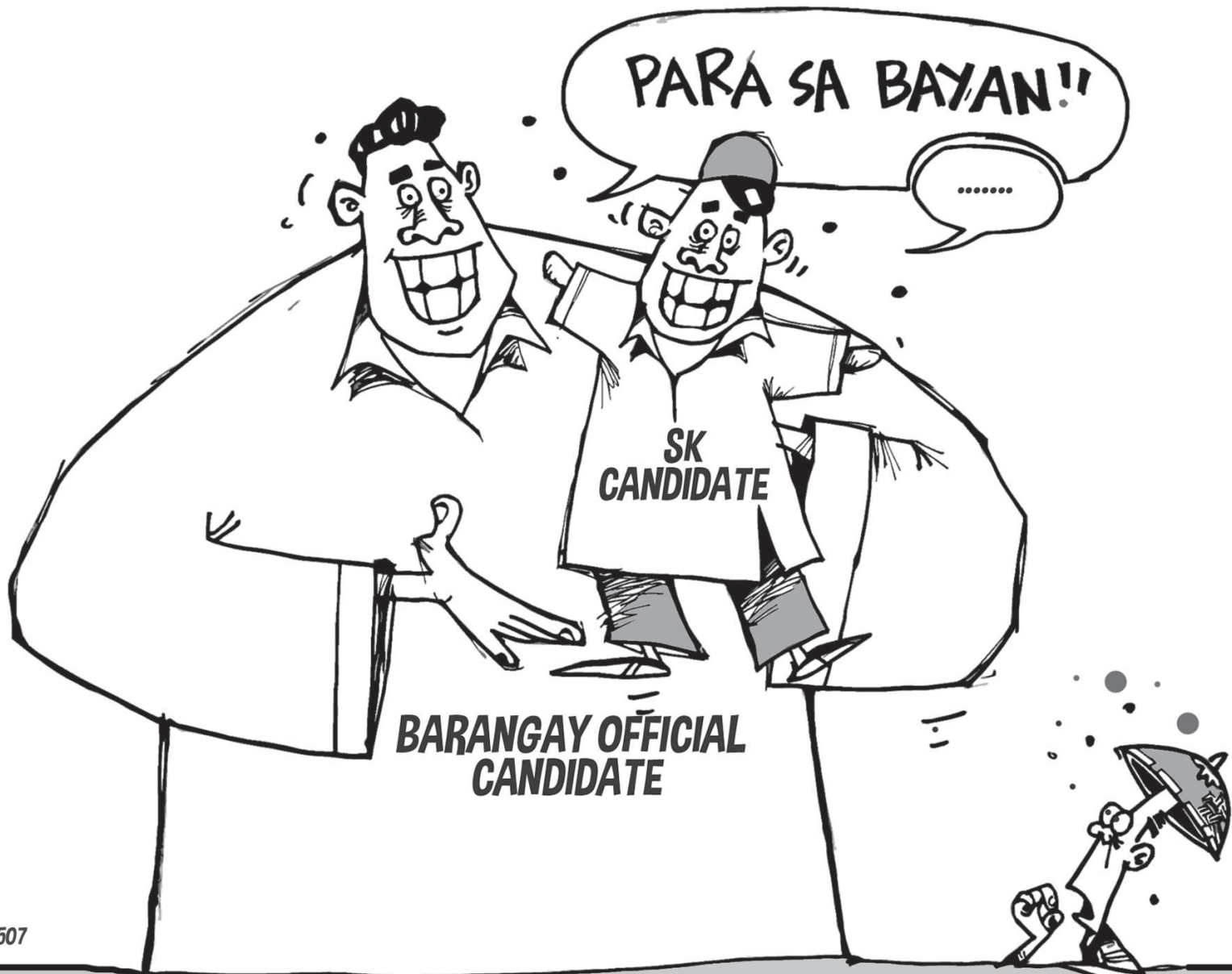
arlene 18 edgedavao 0507