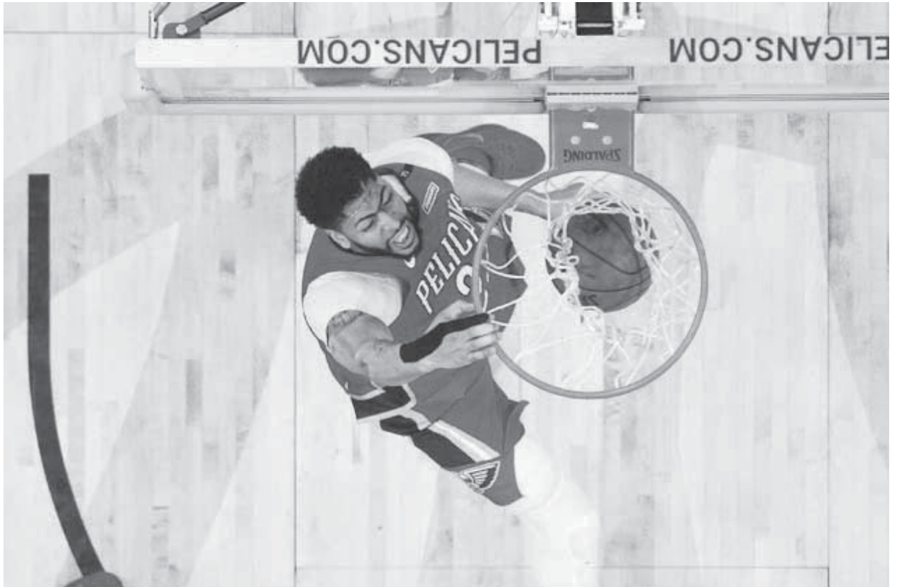
UNFAZED. Pelicans’ center Anthony Davis vowed his team will bounce back after losing Game 4.

had 26 points and 12 rebounds for New Orleans, but the Pelicans hit only 36 percent (32 of 88) of their shots, missing 22 of 26 3-point attempts.